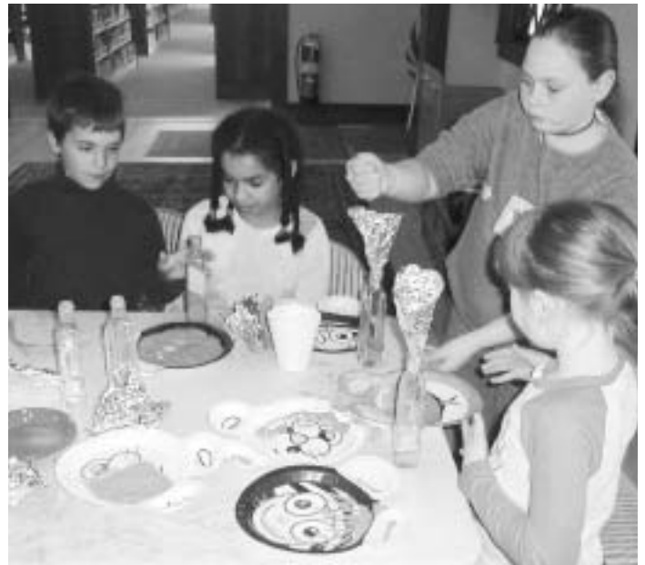
Young teens participate in a Sand Art craft program, one of many activities offered to teens at the library.